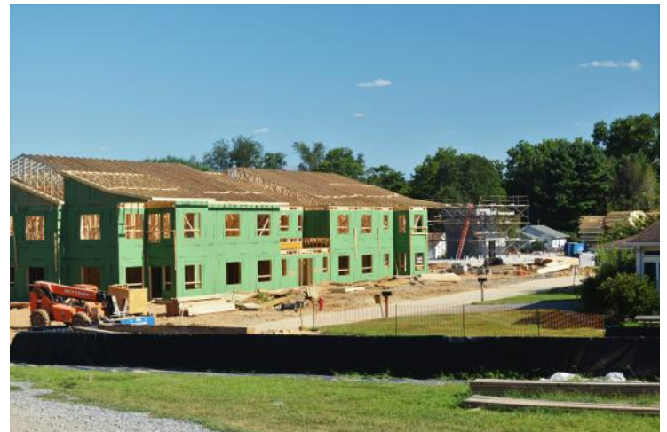
Lodge up and another soon