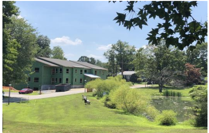
Lodge 17201 Quaker Lane (interior work underway!)