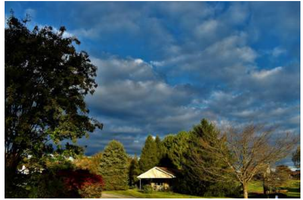
Extraordinary cool, blue sky over Friends House

Right: Friends House Pond taken from a drone. We also have a creek and the Sandy Spring (see arrow on picture) to inspire our hearts and souls!