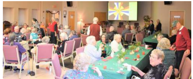
Top: Christmas Party and artists works