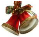
Below: Many staff brought family members to enjoy a great lunch and celebration of