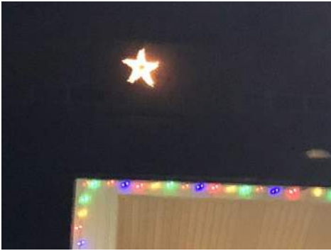
The Star over Stabler Hall shines Light on us and our neighbors in the dark of winter.