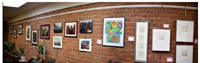
Below: Wellspring artists in Flower Alley