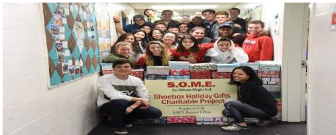
Ninth grade class at SSFS