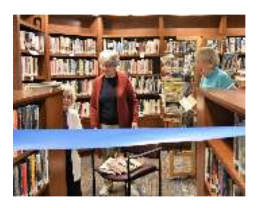
"Many hands make light work"

We are celebrating our newly renovated Friends House Library, with its new seating area and especially the easier-to-reach book shelves.