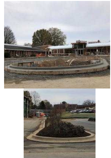
The Commons circle and the new entrance off Norwood Road

Winter is arriving with howling winds and cold. Today, at Friends House, we are seeing green, new trees, and the hopes of Spring here on campus with completed buildings, new residents, and trees and shrubs blooming!! Above, see the campus restored as construction nears the end. Come Visit Us!!