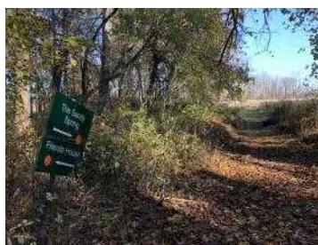
Sandy Spring—A great place to sit, relax, mediate, read, bird watch (blue birds!) or whatever inspires you.