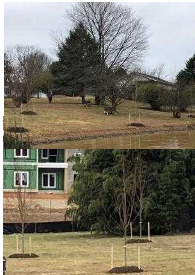
New trees around the pond