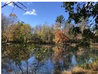
Pond at Sandy Spring Friends School

It was a beautiful October fall day – warm, sunny, not too hot – a good day to be outside or have your windows open here at Friends House. It was also the day when Quaker Knoll Road was being ripped up, the new road was going in at Stabler Hall and many other workmen were here on campus working on all the new structures. Noisy and dusty!!