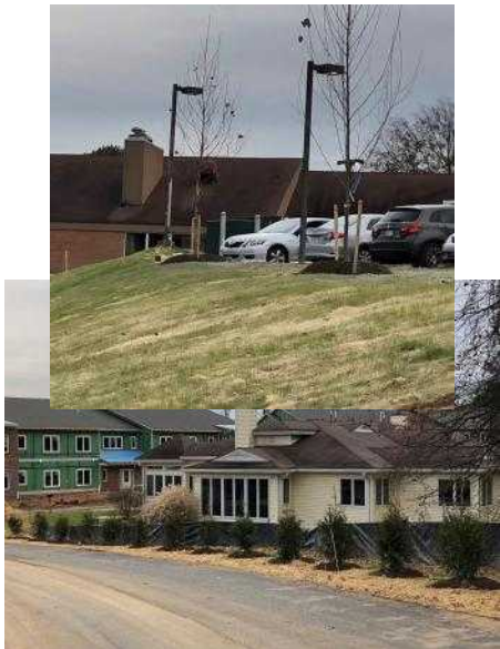
New grass is coming up with new green trees